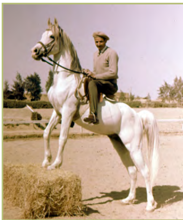
Mabdooi 1948 grey stallion (El Deree x Malaka), Malaka's first son and arguably one of El Deree's most handsome ones. Unfortunately he was not used, but his famous 3/4 brother Azmi was used - an important sire in Russia.