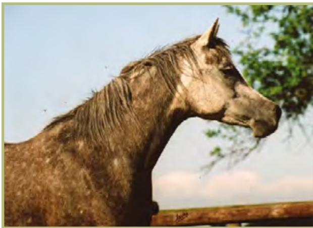
El Thay Mahfouza (El Thay Ibn Halim Shah x El Thay Mansoura) a great broodmare for El Thayeba, awarded Premium Mare title.