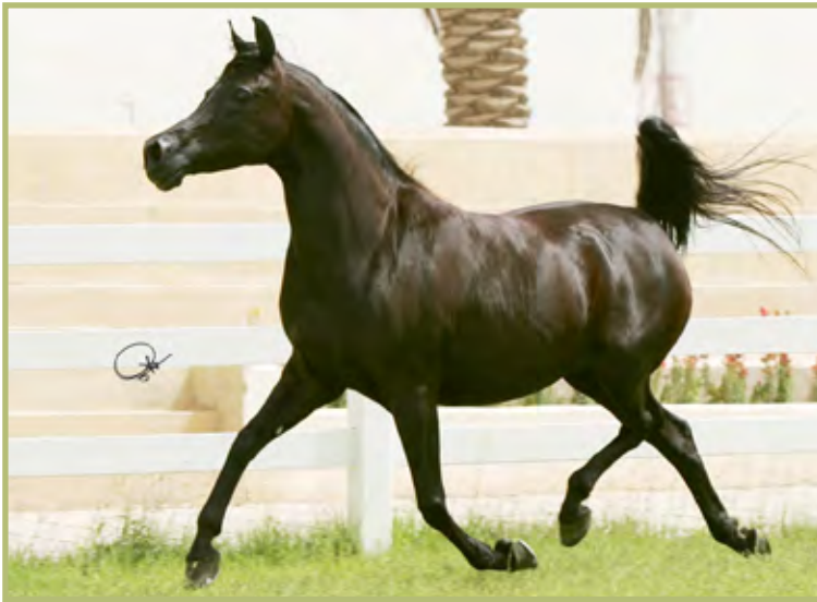
Mona A (Hafeed Anter x Dbimaara) beautiful black mare bred in Egypt tracing to Hekmat in female line. A key broodmare for Shaikha Sarah Al Sabah's Al Arab stud in Kuwait.