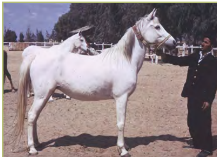
Samia (Nazeer x Malaka) 3rd mare of the "golden cross" and another fine producer in Egypt for the Bint Riyala line.

The final example of the "golden cross" of Nazeer with Malaka comes from the mare Samia, a 1952 grey mare. Though she did not have a lot of foals, her three daughters spread her influence internationally in many admired straight Egyptian horses. Samia's three daughters are Noha (x Mashhour), and the two full sisters Serenity Sagda and Hekmat, both by Anter.