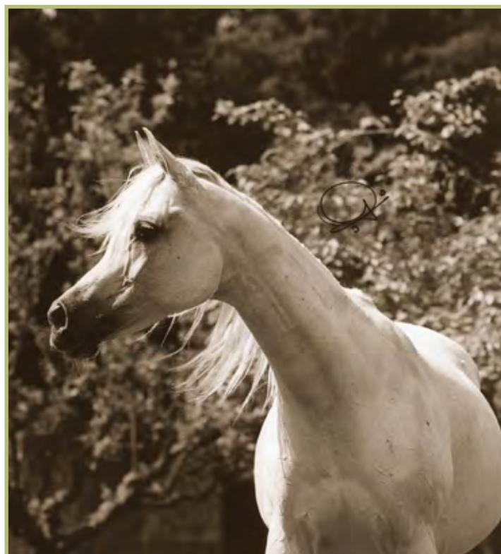
The beautiful Bint Bint Hamamaa (Nabiel x Bint Hamamaa) famous as the dam of famous Egyptian sire Shabeen [El Habiel] tracing to Samia through Hekmat.

Imported by Serenity Egyptian Stud, Serenity Sagda (Anter x Samia) produced champions in North