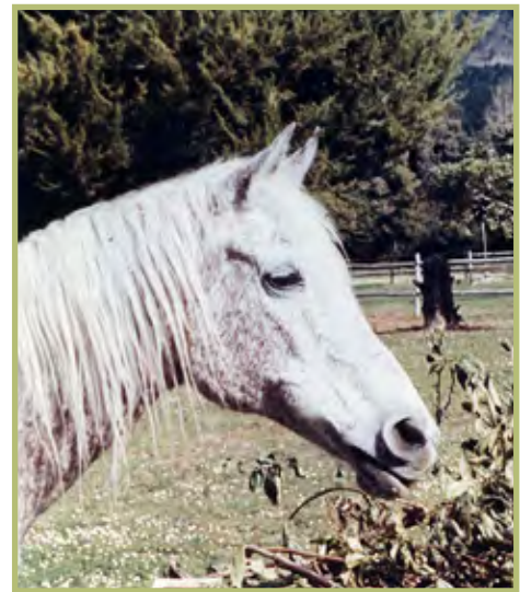
Baraka (Ibn Manial x Gamalat) in old age in South Africa. She was the last of the celebrated Kubaylan Mimreh strain, the strain of Nazeer's sire Mansour.