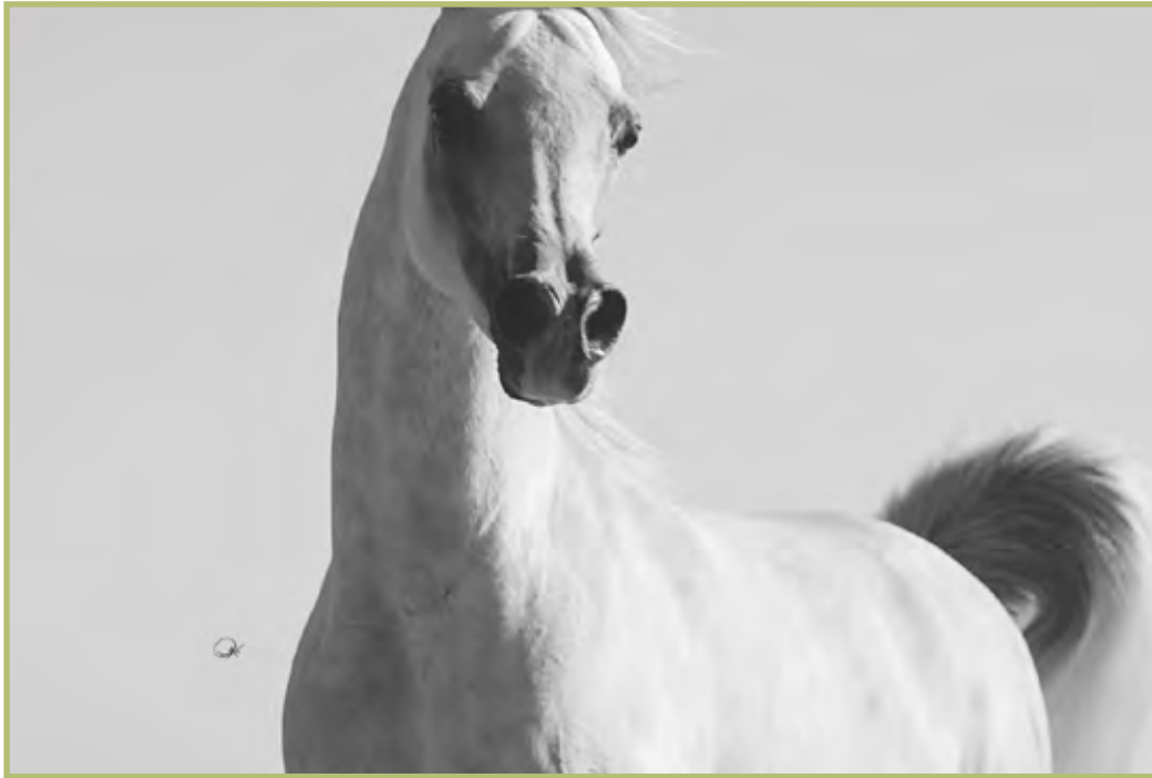
El Thay Mahfouz (Ansata Selman x El Thay Mahfouza)