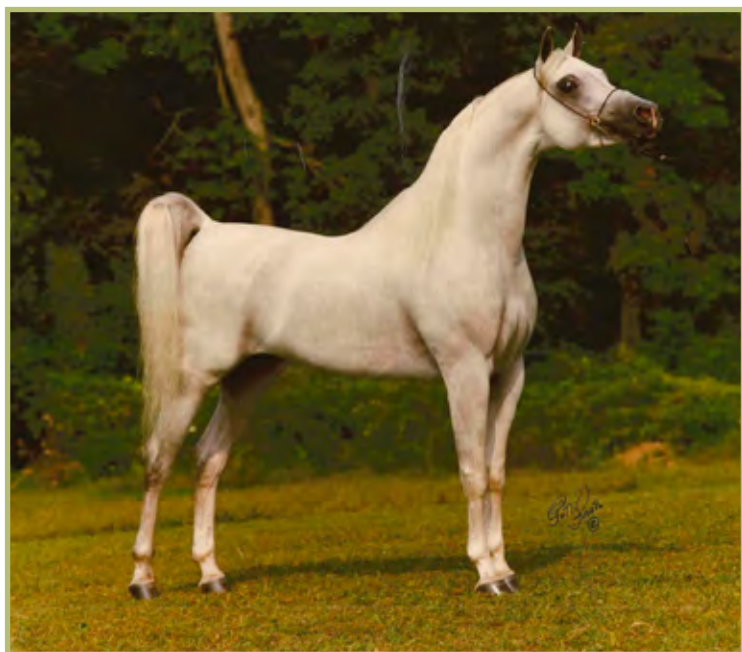
The incomparable international champion and sire of champions, Imperial Imdal, a Kubaylan Rodan of the Bint Riyala dam line.

Bint Rissala, though related to Bint Riyala was a different type of mare resembling more her sire Ibn Yashmak. She was tall, elegant and tended to produce size, elegance and brilliant motion. Interestingly Bint Rissala was the highest percentage of Abbas Pasha/Ali Pasha Sherif breeding at 87.5% and it seemed to show persistently in the elegance of her line. With 13 foals she was