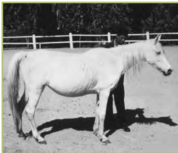
Ameena (Hamdan x Yaman) foaled at Inshass Royal Stud in Egypt pictured in old age. Ameena's descendants possess a certain magic with many refined and beautiful descendants.