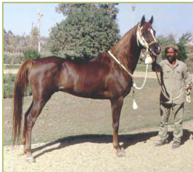
The great EAO sire Alaa El Din (Nazeer x Kateefa), a grandson of the mare Bint Rissala, and sire of many superior producing mares.