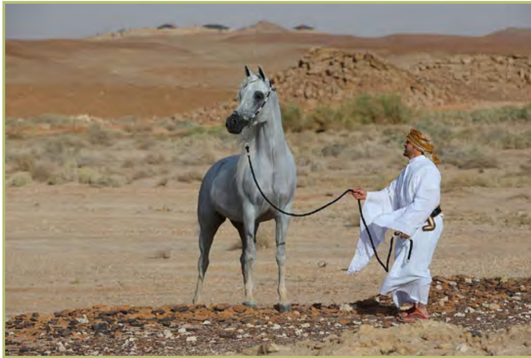
Alfabiya Jumeira (Phaaros x Grea Bint Khattaara) tracing to Ameena via Omnia. Owned by Alfala Stud - KSA.