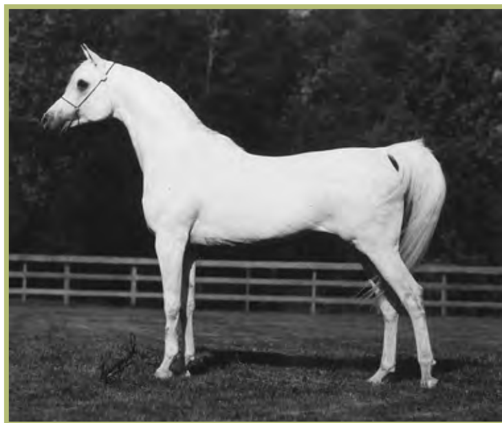
Prince Fa Moniet (TheEgyptianPrince x Fa Moniet) an extremely prepotent sire representing intense Saklawi on the dam line of Bint Yamama.

Interestingly this pedigree represents the combining of the elegant Bint Rissala from Alaa El Din with the fine qualities of Shahbaa. Most of Shahbaa's foals were by the masculine Gassir but when crossed back to Saklawi the results sustain this special elegance of the female line. One example I recall was the handsome stallion Shah Zoom, sired by Ansata Shah Zaman (Morafic x Ansata Bint Mabrouka) and out of Bint Shahbaa I (x Gassir). Of course one of the famous sons of Safnaz was Imperial Egyptian Stud's Ibn Safnaz. Sired by the high quality and masculine stallion Seef, Ibn Safnaz produced many fine daughters from a variety of strains.