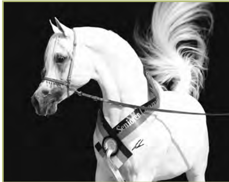
Gold Champion at Aachen, GR Amaretto, a much admired stallion tracing in female line to Nazeera.