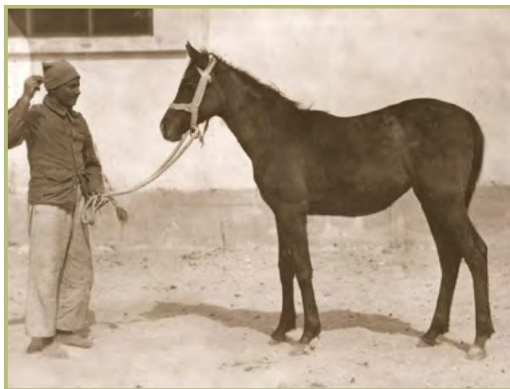
The Bint Riyala line comes down from Malaka, shown here as a filly in late 1941. Already the fine quality of this line is apparent in Malaka as a youngster.

arrived in 1920 in Egypt with the purchase two fillies from Crabbet, Bint Riyala and Bint Rissala. So for this newsletter let us explore further the family from Bint Riyala.