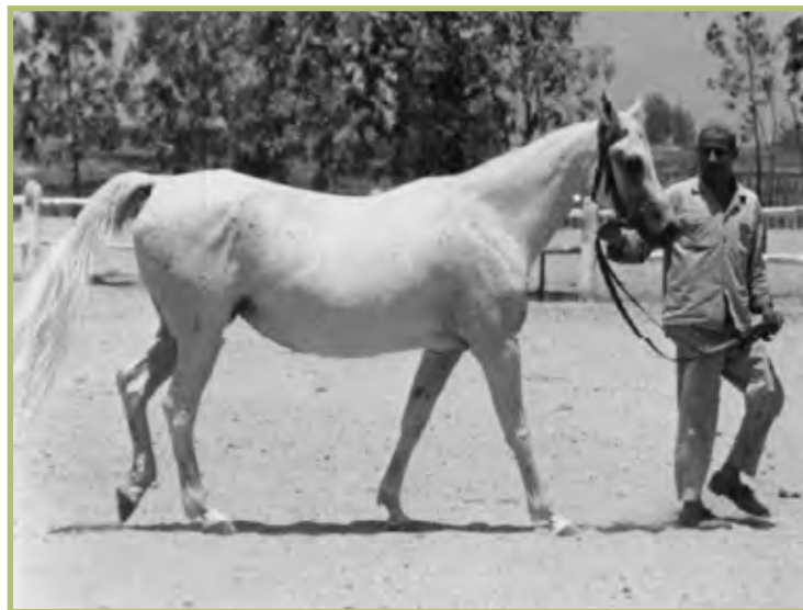
Nazeera (Nazeer x Malaka) one of 4 full siblings that would be a "golden cross" and spread the fame of Bint Riyala's line. Many international champions trace to Nazeera.

As I had noted in my last newsletter, Malaka's only daughter allowed to leave Egypt was the Gleannloch import to the US, Salomy (x El Sareei), who also proved a fine broodmare of show winners. Meanwhile in Egypt, from Nazeer came a renowned golden cross of full siblings out of Malaka: Waseem, Nazeera, Mamlouka and Samia. Waseem proved to be a sire of excellent broodmares especially for Albadeia Stud that included the celebrated matron Malekat El Gamal, the female line of world-renowned international champion and sire of champions Al Adeed Al Shaqab. Nazeera counts among her most famous descendants, World Champion