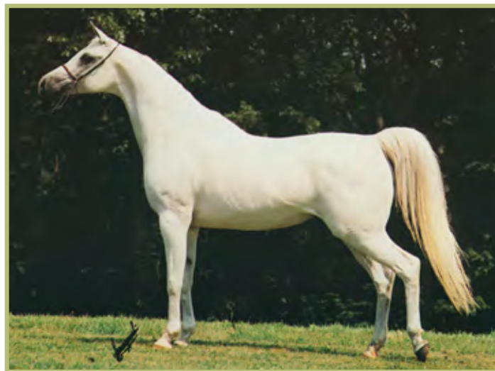
Fawkia (Sameh x Mamlouka), an excellent Sameh daughter imported by Gleannloch and later a mare for Imperial. Dam line of numerous champions. Renowned as the dam line of Imperial Madori.

Momtaza (x Sameh). In North America the Mamlouka branch has long proven itself in high quality and performance. From SF Bint Mamlouka came the racing winners Serenity Ibn Khofo and Serenity Mamlouk. SF