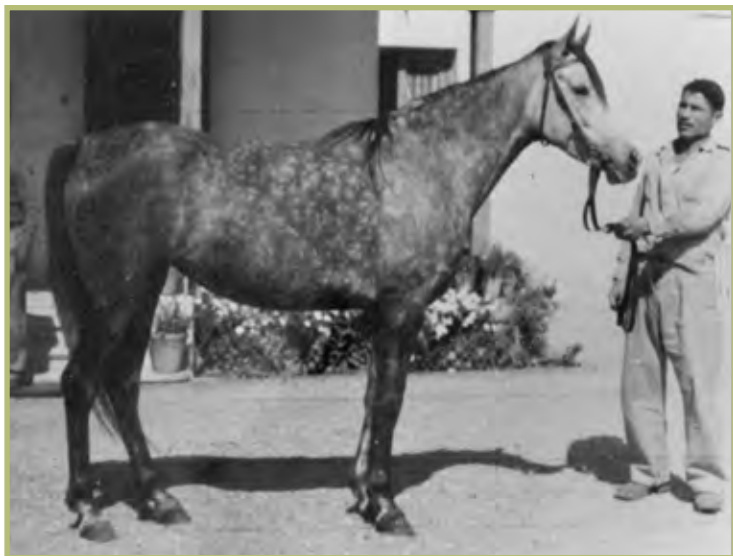
Salomy (El Sareei x Malaka) Malaka's only daughter allowed to leave Egypt, and a high quality mare imported by Gleannloch. in Egypt.

sired by the racing sire Kheir. Malaka's pedigree already represented two generations of Saklawi sires top-crossed on Bint Riyala which was perhaps a foreshadowing of how Malaka would create a dynasty from her "golden cross" with the legendary Nazeer who, though Hadban by strain seemed to impart so often the fine Arab qualities of his celebrated sire line to Saklawi I.