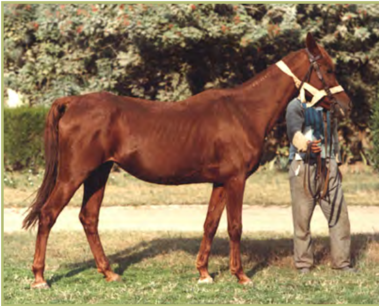
Safinaz (Alaa El Din x Ramza), shown here in old age at the EAO. She was considered a "second Moniet" in type. She is of the Kubaylan Kroush strain and dam of Ibn Safinaz.