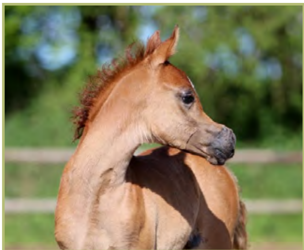
El Thay Mezneh (Nader Halim x El Thay Munifa) 2015 filly, the 6th generation from the original mare Momtaza. This strong family continues successfully at El Thayeba and for other breeders.