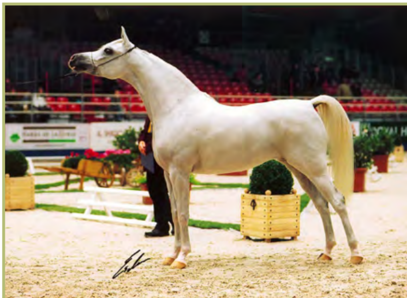
Among Imperial Madori's famous champions is beloved World Champion mare Gelgelah Albadeia.