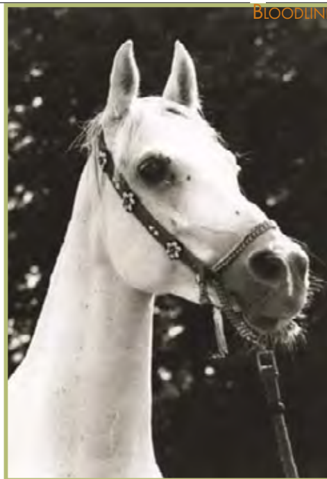
Fawkia's full sister, the lovely Momtaza (Sameh x Mamlouka) built a dynasty for El Thayeba Arabians in Germany.

and Momtaza, imported to Babolna and afterward a key foundation mare for the celebrated El Thayeba stud. Fawkia produced champion mare Ana Gayah for Gleannloch. For Imperial Egyptian Stud Fawkia produced the great broodmare Imperial BtFawkia, granddam of international champion sire Imperial Madori, sire of World Champion mare Gelgelah Albadeia.