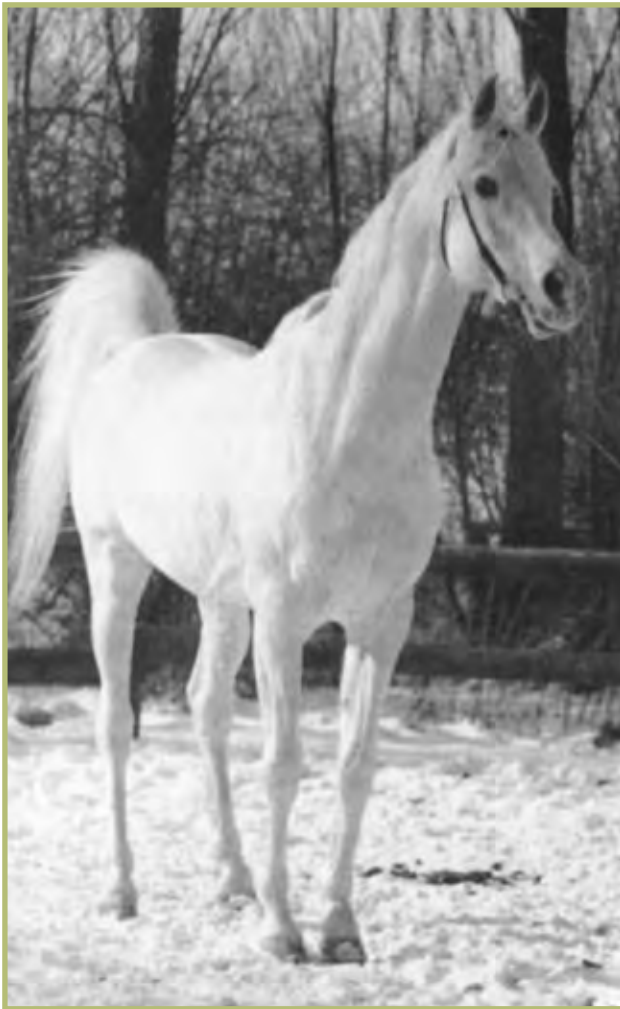
Farag, (Morafic x Bint Kateefa) a classic stallion whose dam was a granddaughter of Bint Rissala. An influential sire in Europe.