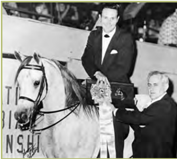
The beautiful Dalia (Morafic x Romanaa II) a Nazeera granddaughter who won many championships. Her claim to fame is as the dam of celebrated sire Imperial Imdal.