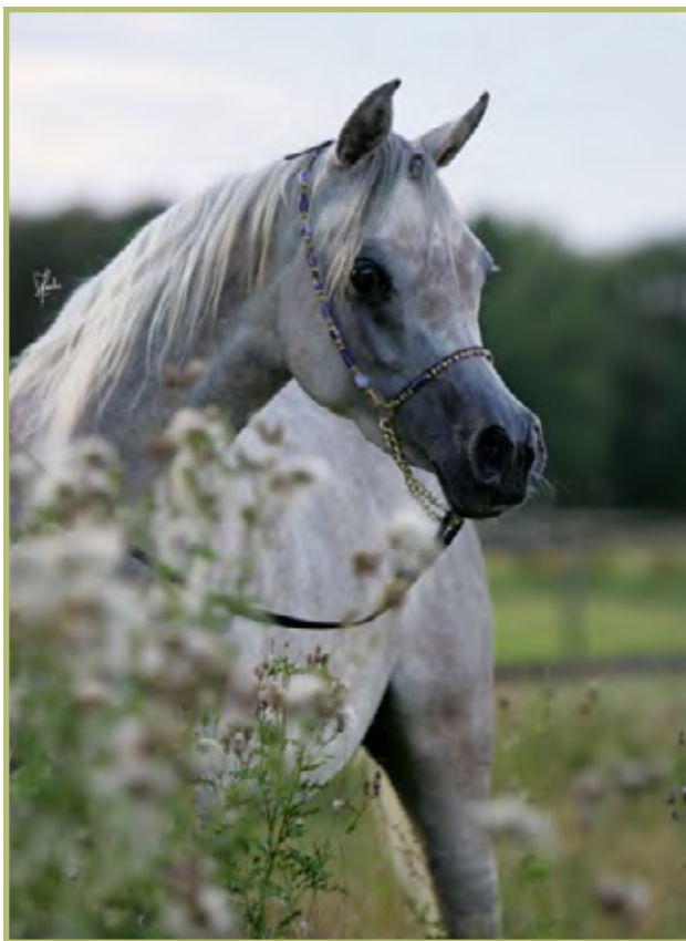
El Thay Munifa (El Thay Mahfouz x El Thay Malakah) a lovely double Momtaza descendant and fine example of multiple crosses to Bint Riyala. El Thayeba archive.

German registry. From this line comes such notables as El Thay Mameluk (Ibn Nazeema x El Thay Mansoura), an important sire for El Thayeba, as well as Babolna and other European breeders, later at stud for Talal A. Al Mehri's Aljazira Stud in Kuwait. El Thay Mameluk's half sister El Thay Mahfouza (El Thay Ibn Halim Shah x El Thay Mansoura) was awarded Premium status and is the dam of the exotic stallion El Thay Mahfouz. El Thay Mahfouza created a lasting legacy for Momtaza's line at El Thayeba as illustrated by the many beautiful high quality horses of this line continuing all the way to the lovely filly El Thay Mezneh, now the 6th generation of this line from Momtaza.