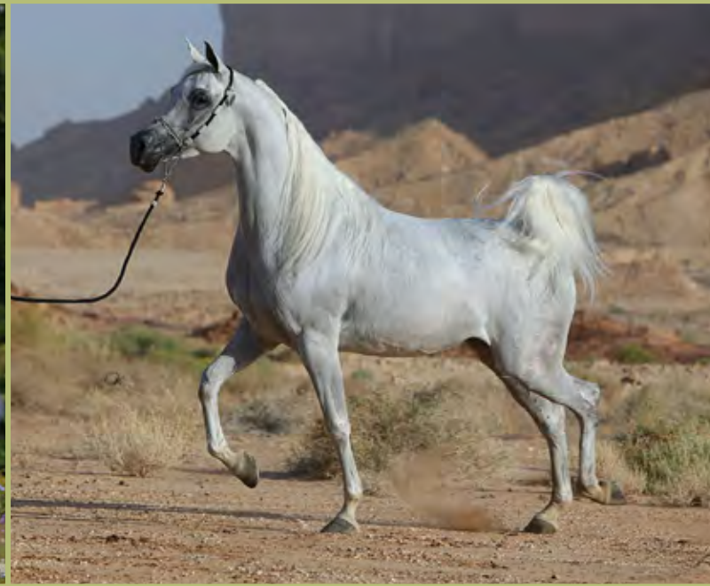
The magnificent Grea Bint Khataara, key progenitor of Bint Rissala's line from Omnia, and dam of Alfabia Jumeira. Both owned by Alfala Stud.

Omnia's daughter AK Khattaara was a magnificent producing mare, and being by Ibn Moniet El Nefous, she showed how this line blends well with Saklawi. If she had no more foals than her first son, Al Kidir (x TheEgyptianPrince) that would be enough as he proved to be an excellent sire on several continents. But AK Khattaara also produced the magnificent mare Grea Bint Khattaara (x Moroc), dam of the stunning mare Alfabia Jumiera (x Phaaros), who combines perfectly the Bint Riyala and Bint Rissala lines with high percentages of Dahman and Saklawi.