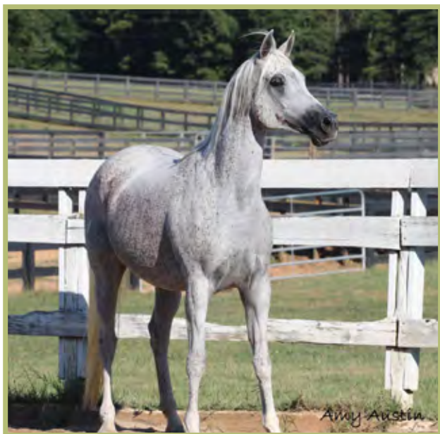
Temima (ZT Faa Iq x Tasaqqara) a beautiful broodmare at Talaria in the US. She is tail female to Bint Rissala and has 5 crosses to her.