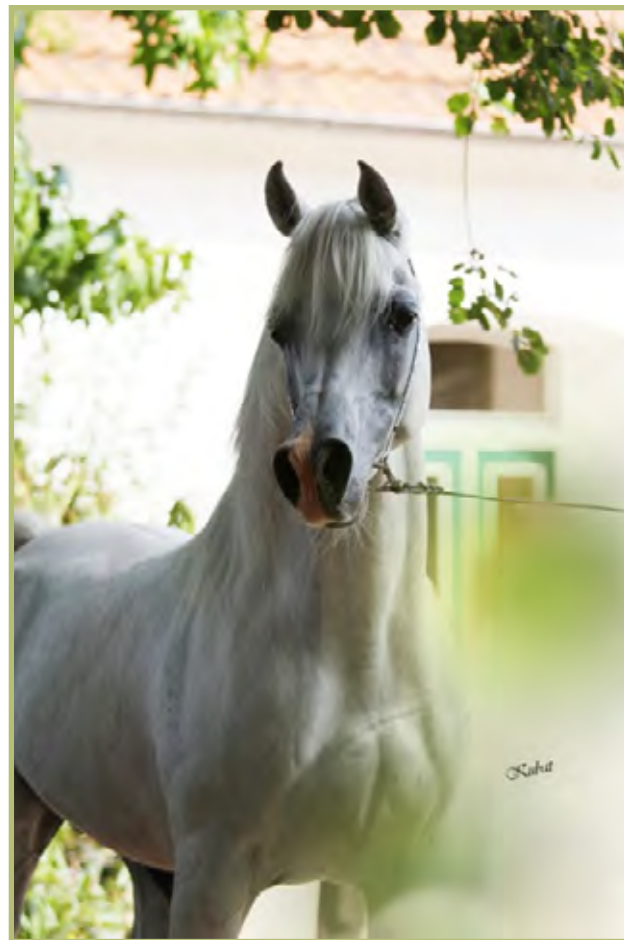
The exotic El Thay Mahfouz (Ansata Selman x El Thay Mahfouza) important sire for El Thayeba.