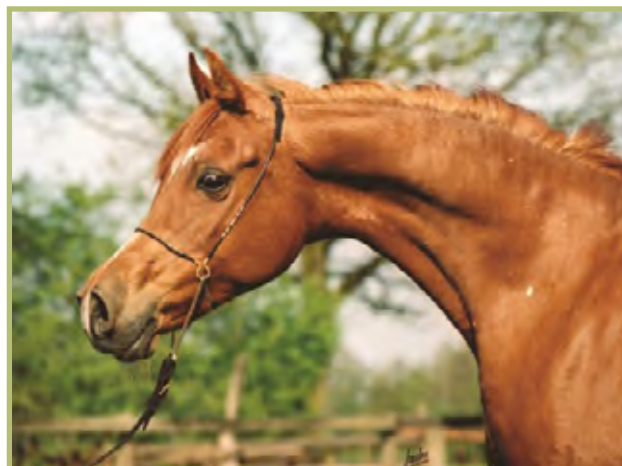
El Thay Mansoura (Machmut x Morawa) a granddaughter of Momtaza, she became an excellent producer for the El Thayeba legacy. Awarded Elite Mare title. She is dam of El Thay Mameluk.