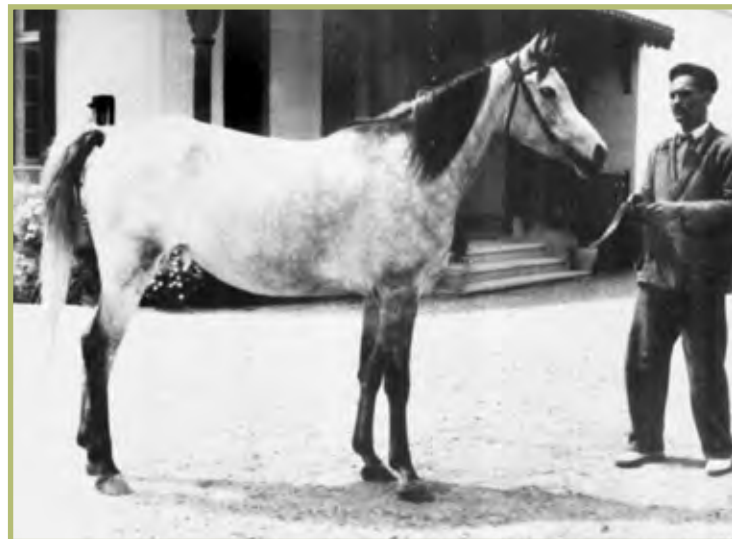
Mamlouka (Nazeer x Malaka) full sister to Nazeera and another lovely mare represented by many champions internationally. Granddam of prized European sire Serenity Habib.

One of the most famous is the Kuhaylan Ajuz Rodan that comes down from the desert-bred mare Rodania, a powerful chestnut born in 1869, making hers one of the oldest Arabian families in the breed. She was known to be an exceptionally high quality mare of great nobility and spirit. Rodania was purchased from the Gomussa tribe by Wilfrid and Lady Anne Blunt as a foundation mare for their renowned Crabbet Stud. Rodania is perhaps one of the most globally prevalent ancestors in the entire Arabian breed. For example Rodania appears 216 times in the pedigree of the celebrated sire Marwan Al Shaqab and in fact even he is a Kuhaylan Ras Al Fedawi by strain. Rodania was already 12 years old when she arrived at Crabbet so only had 5 foals, 3 of which were daughters, the most prolific was Rose of Sharon sired by the desert bred stallion Hadban. Rose of Sharon is