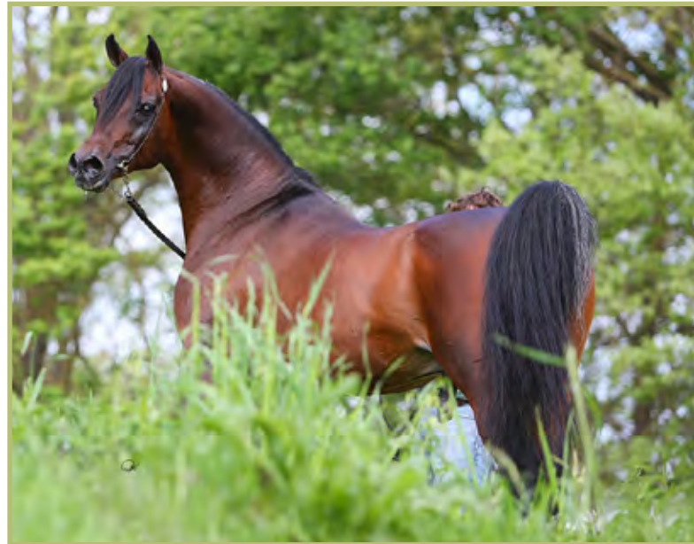
ZT Faa Iq (Anaza El Farid x ZT Jamdusab) a superior sire with 4 crosses to Bint Rissala, one of which is his tail female to Serenity Sonbolah. Owned by Al Rashediah Stud.